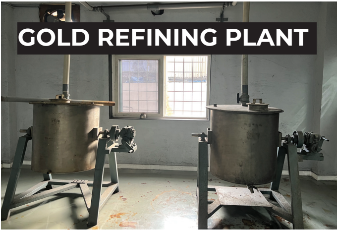
GOLD REFINING PLANT